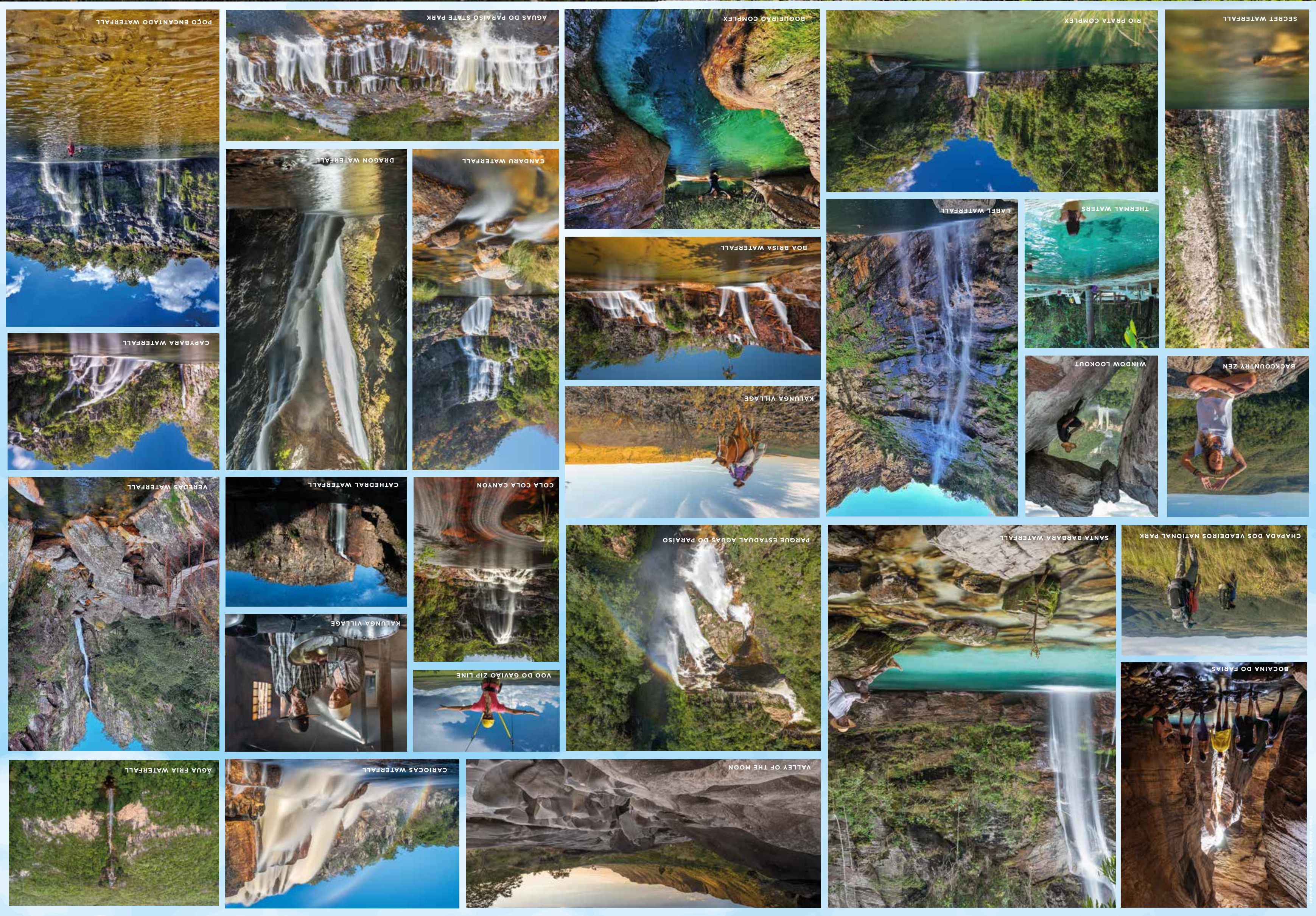
POÇO ENCANTADO WATERFALL

POÇO VERDE IN THE VARGEM REDONDA WATERFALL COMPLEX